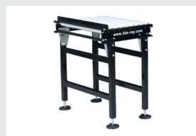
Optional rollers available